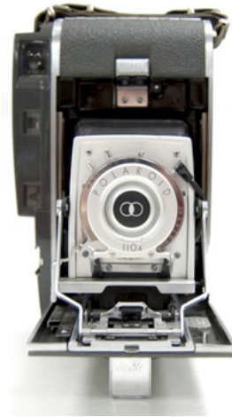
Polaroid 110A from the Wilhelm E. Nassau Camera Collection